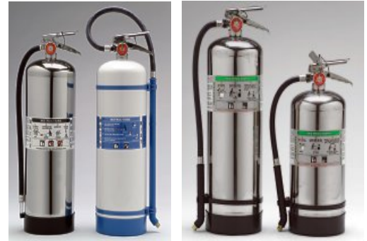
PW2½ & WM2½

This unit is designated for use wherever there is a Class A hazard near electrical equipment and the environment is of paramount concern. The extinguishing agent is de-ionized water, and the wand provides greatest operator safety. There is no risk of electrical conductivity or thermal or static shock. Ideal for use in health care, data processing, telecommunication, and clean room facilities. (Shipped empty)