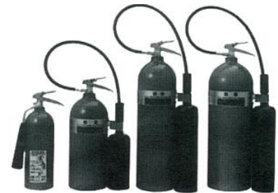
□ CD5 □ CD10 □ CD15 □ CD20